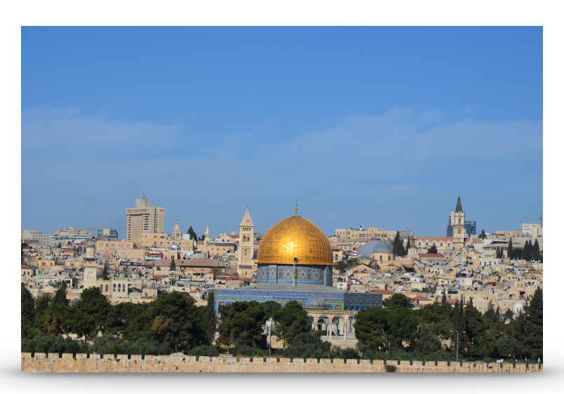
Pay 8: 25th February

After our delightful Israeli breakfast, we leave for the Temple Mount, a place of much conflict between inhabitants over the centuries. We then proceed to the Southern Steps where Jesus sat and wept over Jerusalem. Afterwards we view a short movie on what life was like during the time of the Temple. Afterwards, we will go back in time by visiting the City of Pavid, the Hezekiah Tunnel and then our last stop will be the Pools of Siloam. We will visit Yad VAshem in the late afternoon.